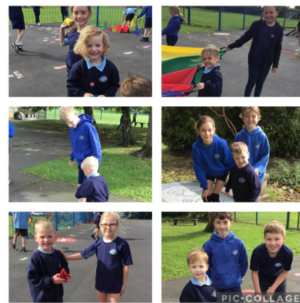
We showed great courage when meeting our new friends!

We've had a lovely week in Class 5/6! In maths, we have started to focus on the place value units for our year groups and the children have impressed me with their knowledge (despite having had 6 weeks off). In science, the children have been looking at classification and more specifically taxonomy. They will be putting their knowledge to the test next week as they have a go at classifying animals themselves using this system. Wednesday mornings are now a firm favourite as the children enjoy both their music and Forest School sessions. Finally, Year 6 met their Little Friends this week which was lovely to see and a definite milestone in their Year 6 journey.