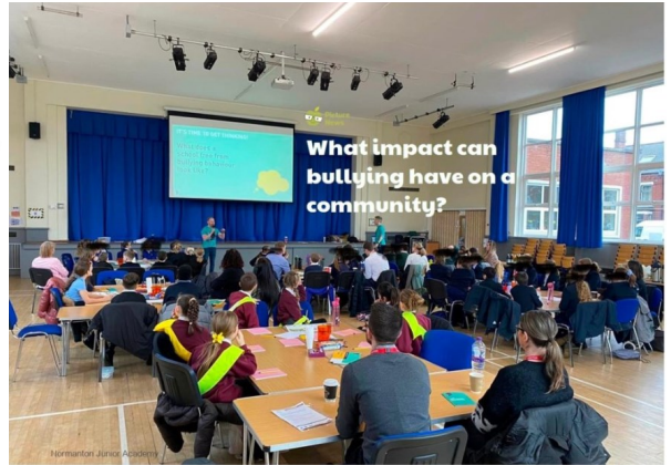
What impact can bullying have on a community?

My behaviour actions and words can affect others. Listening to each other, showing kindness, celebrating differences and choosing respect can help to make everyone feel happy, comfortable and safe.